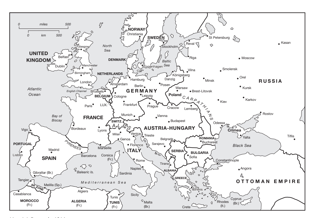
Map 1.1 Europe in 1914